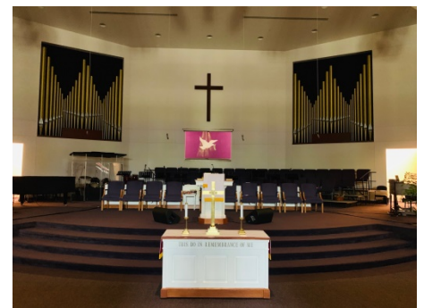
The repair work launched by trustees in 2020 on the sanctuary roof and lighting and other areas of the church building was completed in 2021.