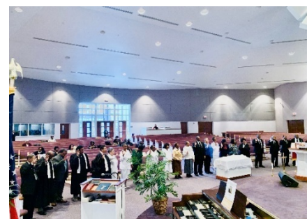
Friendship's elected leaders are installed for their 2020 service to the Church.