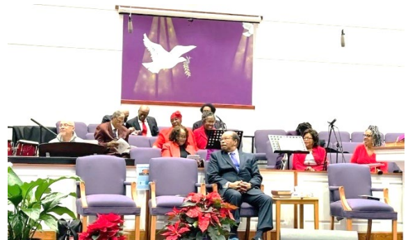
The Anniversary Choir Ensemble and Musicians gathered to help celebrate Friendship's 89 th !