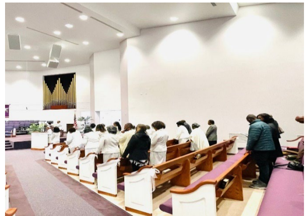
FBC Missionaries honoring the 2023 Mission Sunday all dressed in white on November 12.